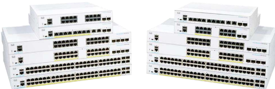
Figure 2. Cisco Business 250 series smart switches

The Cisco Business 250 Series is the next generation of affordable smart switches that combine powerful performance and reliability with a complete suite of the features you need for a solid business network. These switches provide flexible management options, comprehensive security capabilities and Layer 3 static routing features far beyond those of an unmanaged or consumer-grade switch, at a lower cost than for fully managed switches. When you need a reliable solution to share online resources and connect computers, phones, and wireless access points, Cisco Business 250 Series Smart Switches provide the ideal solution at an affordable pricing point.