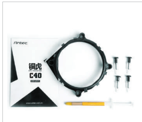
Compatibility with the newest Intel and AMD platforms, and the push-pin mounting system and included gold thermal paste make for a fast, simple installation