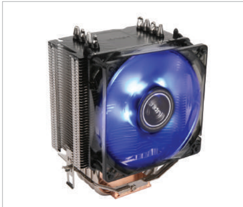
Whisper-quiet, 92mm blue LED PWM fan