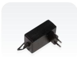
48 V 0.95 A power adapter