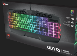
PACKAGE VISUAL 1