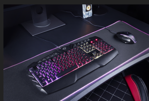
LIFESTYLE VISUAL 1