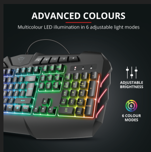
PRODUCT PICTORIAL 1