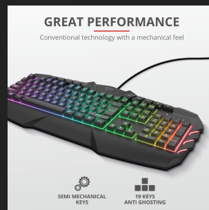
PRODUCT PICTORIAL 2