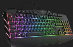
PRODUCT VISUAL 3