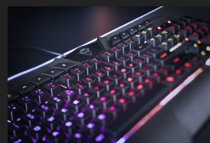
LIFESTYLE VISUAL 2