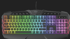
PRODUCT TOP 1