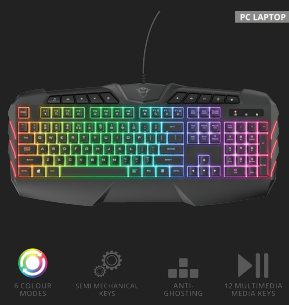
PRODUCT ESHOT 1