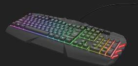
PRODUCT VISUAL 2