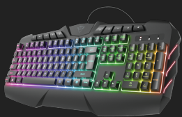
PRODUCT VISUAL 1