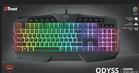
PACKAGE FRONT 1