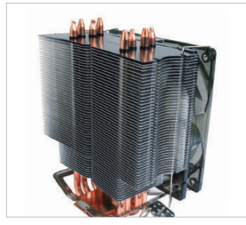
Two-tiered fin structure dissipates heat efficiently, while aluminum oxide coating prevents oxidation