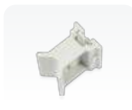
Pole mounting bracket