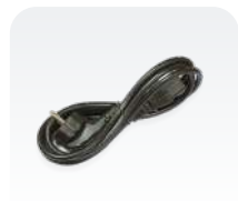
2 Power cords