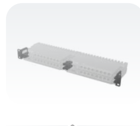
Rackmount kit K-79