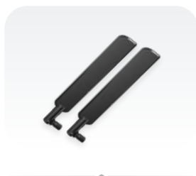
HGO indoor antenna kit