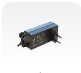
24 V 1.5 A power adapter