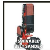
SWIVABLE BELT SANDER