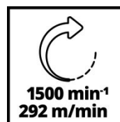
1500 min -1 292 m/min