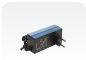
24V 1.5A power adapter