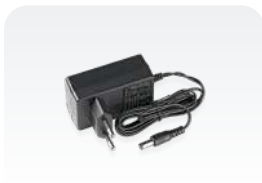
48 V 0.95 A power adapter