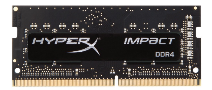
The product images shown are for illustration purposes only and may not be an exact representation of the product. Kingston reserves the right to change any information at anytime without notice.