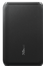
PRODUCT TOP 1