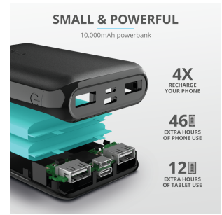
PRODUCT PICTORIAL 2