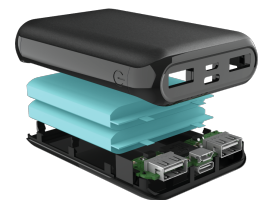
PRODUCT EXTRA 1