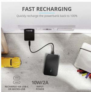
PRODUCT PICTORIAL 6