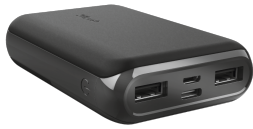
PRODUCT VISUAL 1