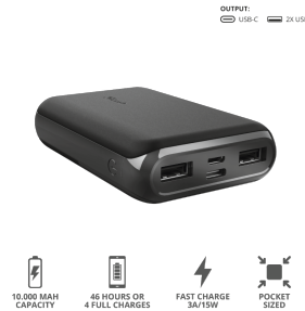
PRODUCT ESHOT 1