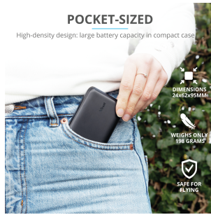
PRODUCT PICTORIAL 1