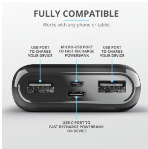
PRODUCT PICTORIAL 3