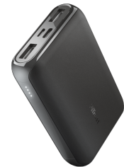
PRODUCT VISUAL 2