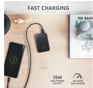
PRODUCT PICTORIAL 5